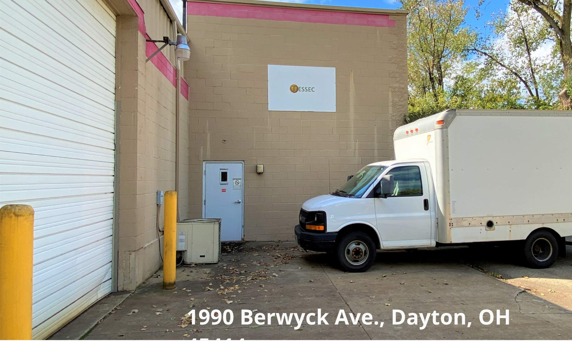
1990 Berwyck Ave., Dayton, OH 45414