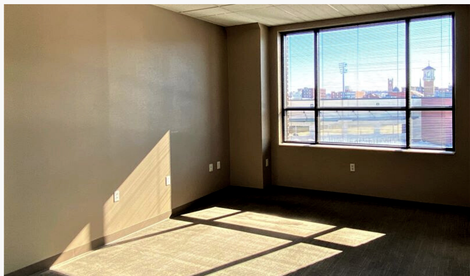
409 E. Monument Ave., 4th floor