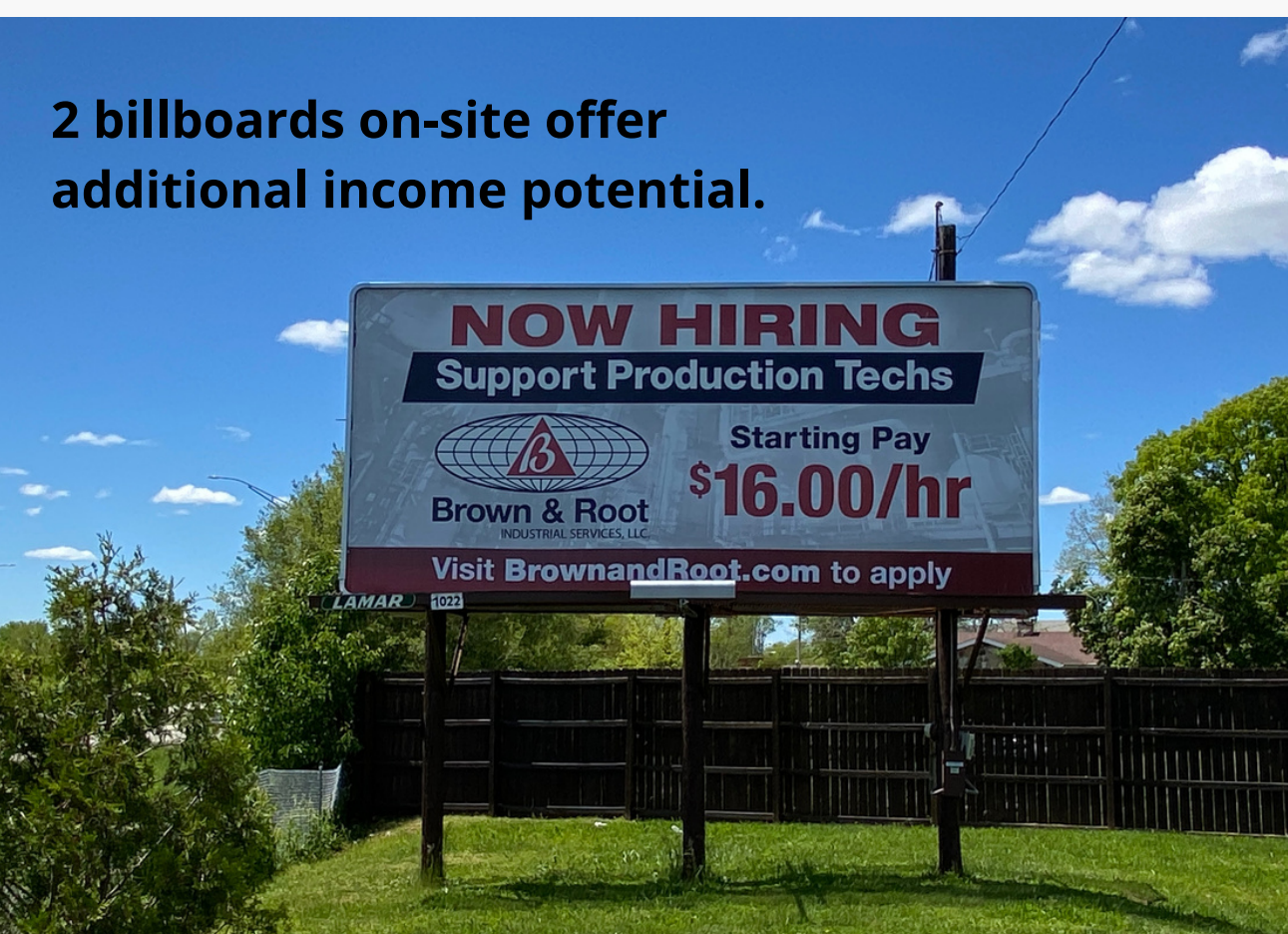
2 billboards on-site offer additional income potential.