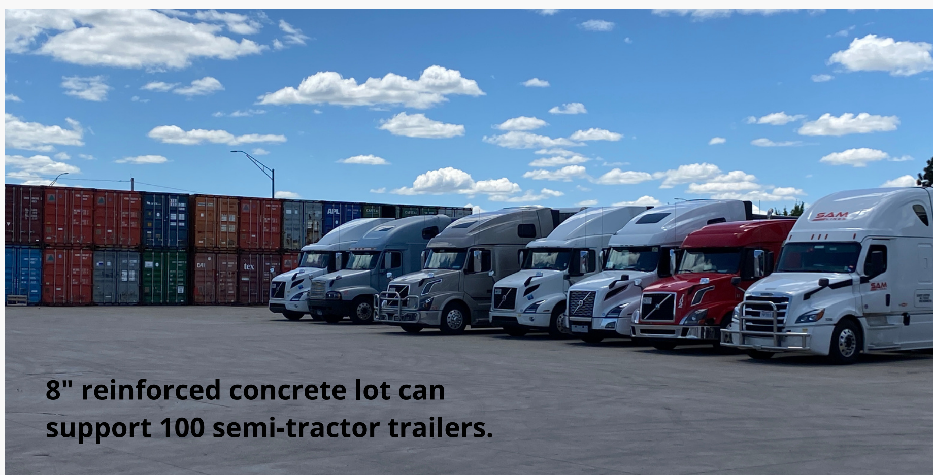
8" reinforced concrete lot can support 100 semi-tractor trailers.