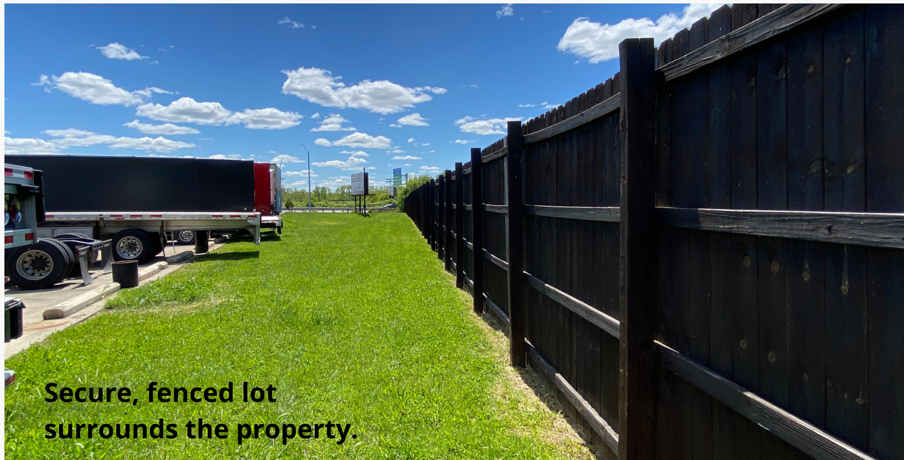
Secure, fenced lot surrounds the property.