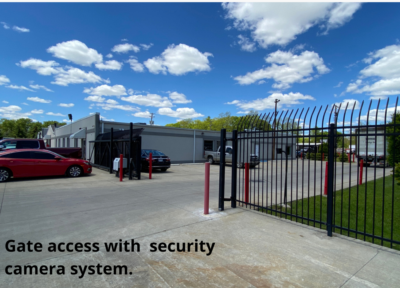
Gate access with security camera system.